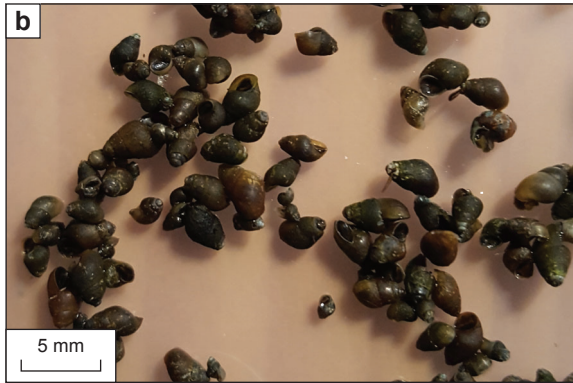
Plate 4: (a) Present-day analog of micro-gastropod Peringia ulvae Pennant with its trail in the intertidal domain, Arcachon Bay (Le Nindre, 1971) and (b) specimens collected in December 2018. This microgastropod forms specific facies in the upper intertidal domain and may be accumulated in the millions.