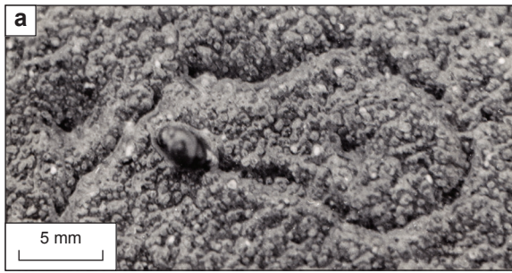
Plate 4: Marrat Sequence IV